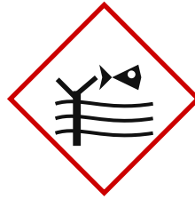
GHS09 Aquatic Hazard